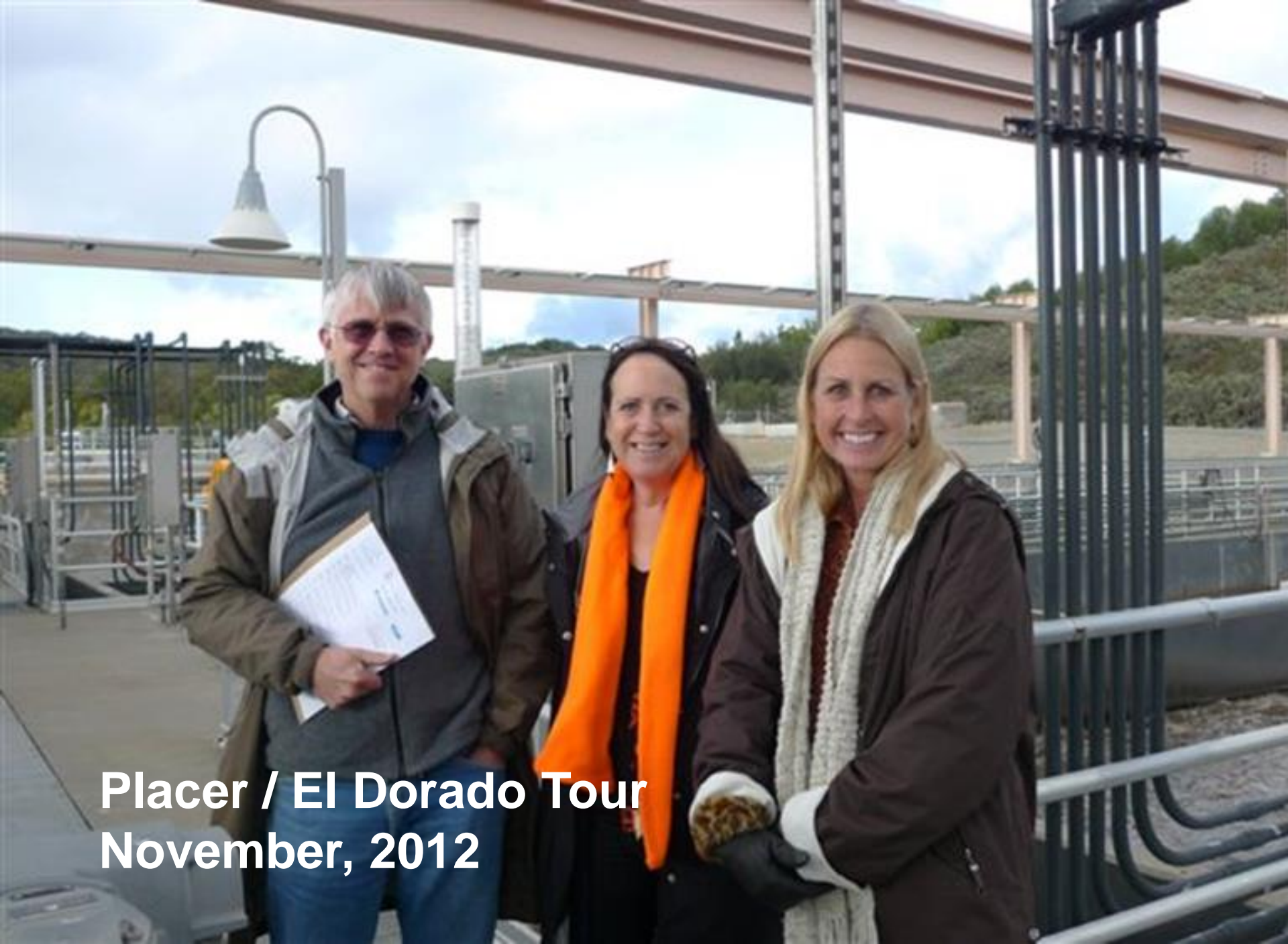
Placer / El Dorado Tour November, 2012