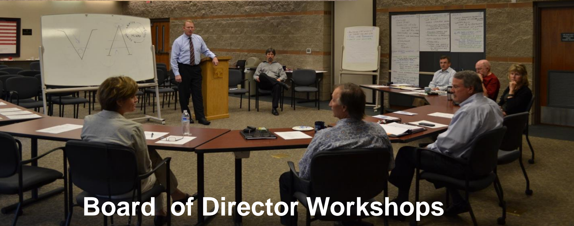
Board of Director Workshops